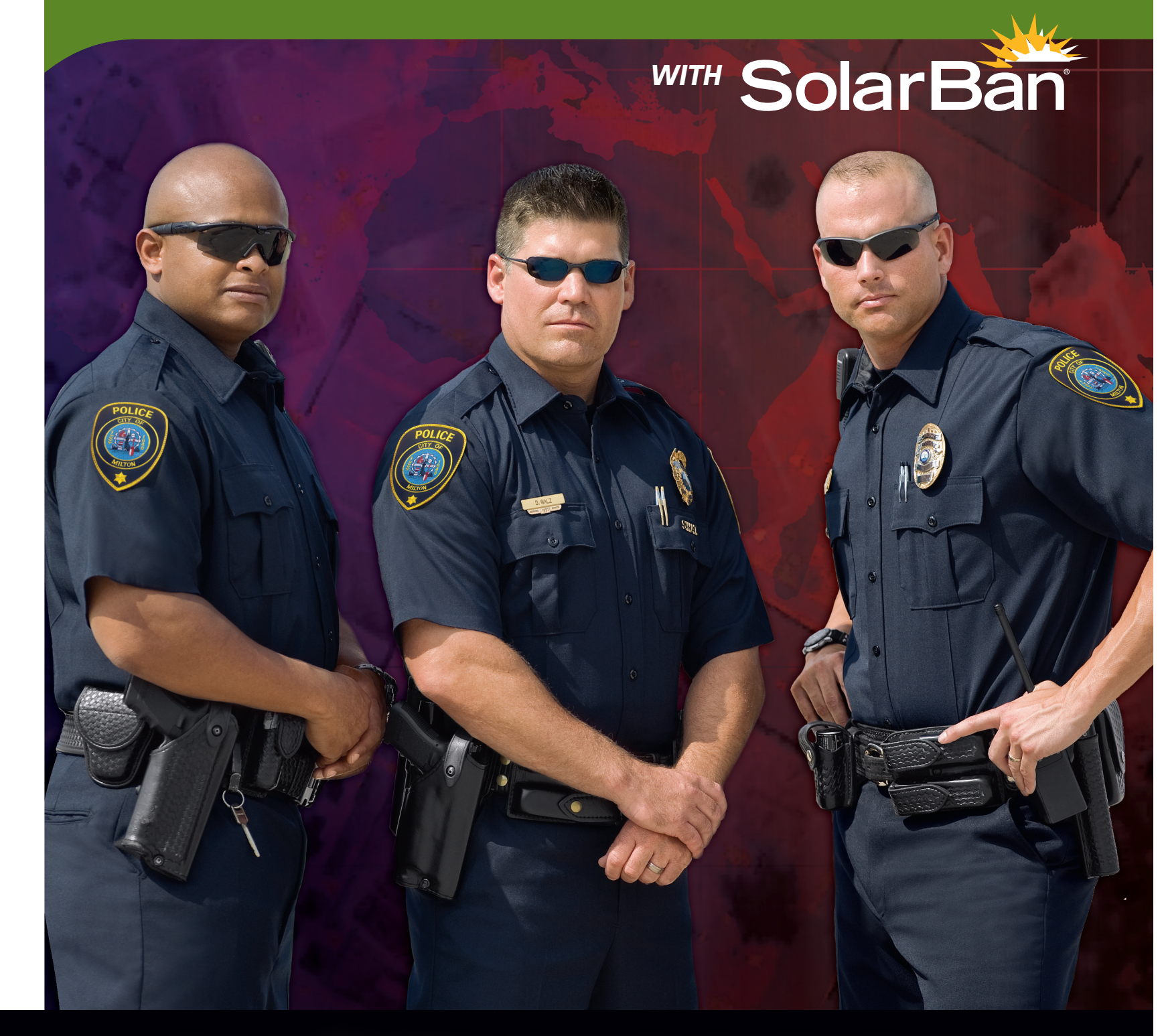
SENTRY PLUS Collection

Keeps you 10° cooler by reducing the absorption of heat rays.